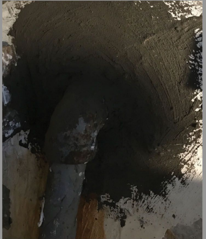
Step 4: Cover foam with a thin layer of concrete thin-set