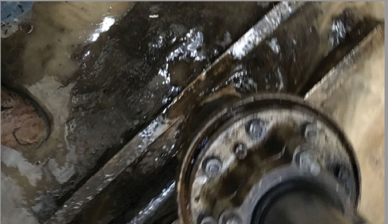
Step 5: Apply CIM moisture eating primer